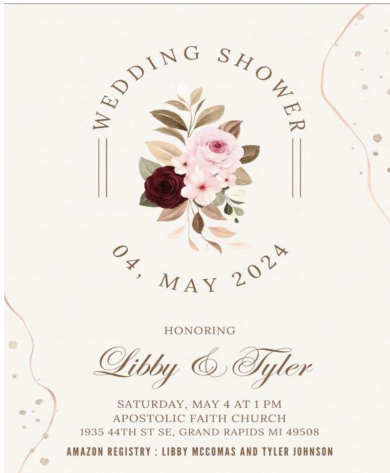
This is a couples shower, so Brothers and Sisters are invited to attend.